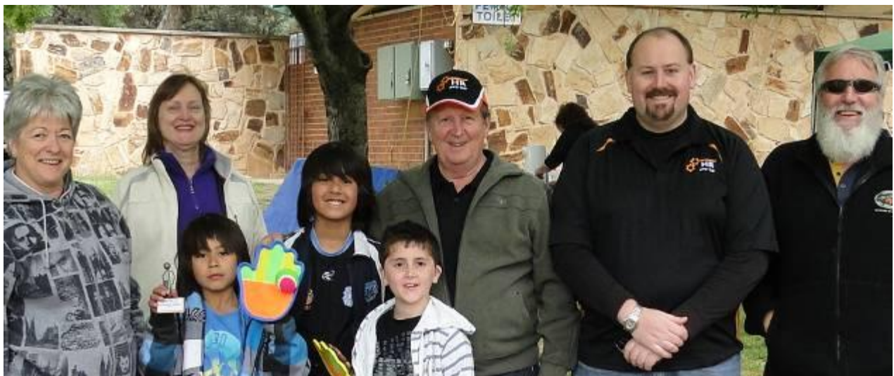
Team HR4WD Club

Even yours truly came third in the egg and spoon race out of a field of three.