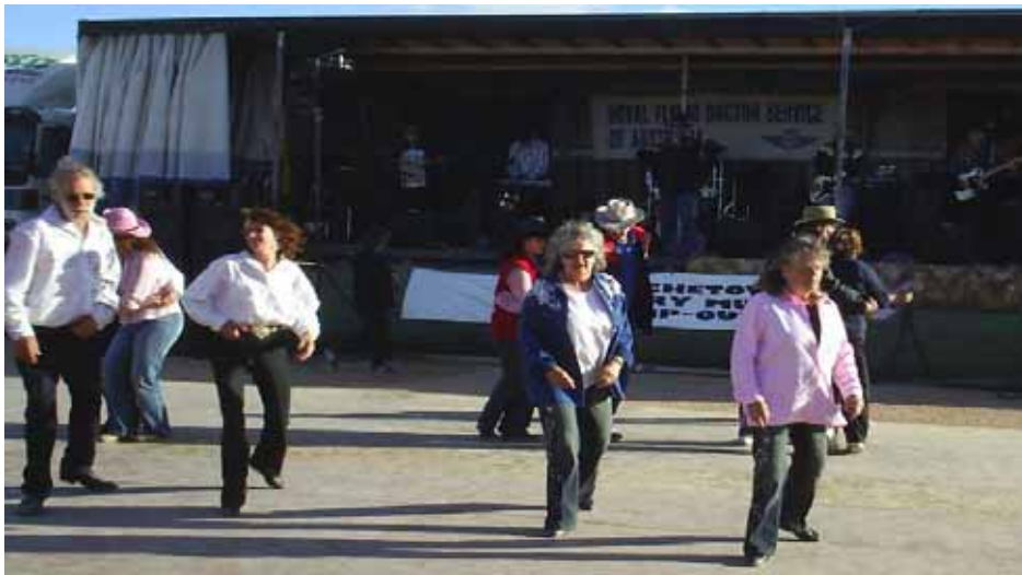
The line dancers never missed a step

This event will be in next years Calender for the last weekend in October 2007