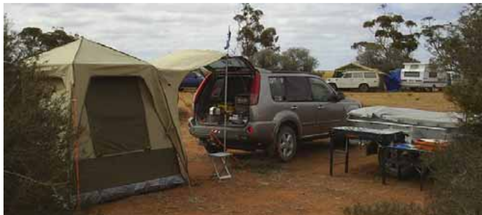
Me, I just camped in the scrub with plenty of open space