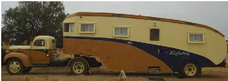
Others in comfort