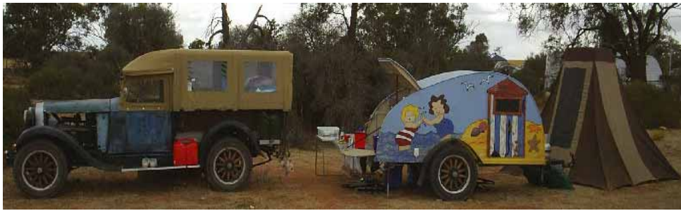
Some travelled & camped in style